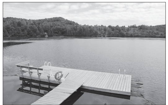
A dock across River Road from the Farm Point Park in Chelsea. A group of Farm Point residents sent a petition to the Chelsea council this week in opposition to the construction of a public dock in their village.

A large number of Farm Point residents have brought their concerns about privacy, parking, and parties, as well as their overall opposition to a public dock in Farm Point to both the Chelsea council and The Low Down.